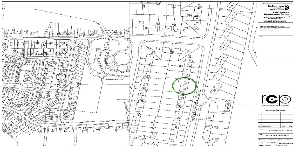
Location Site Plan